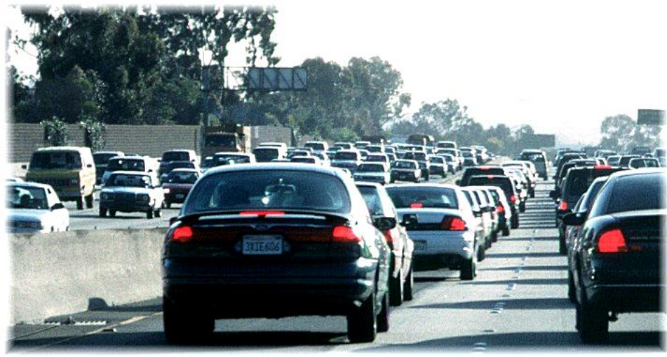
Santa Monica—Culver City—downtown L.A.