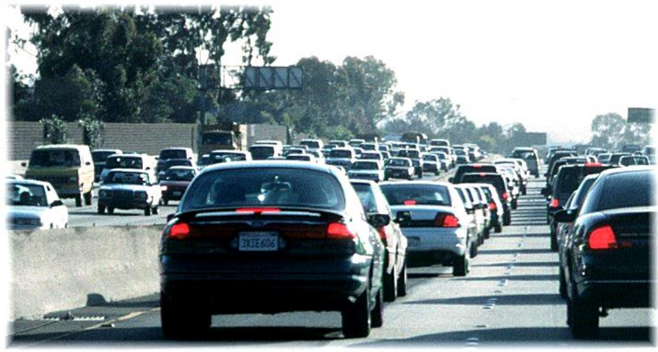
Santa Monica—Culver City—downtown L.A.