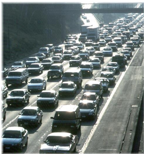
Alternative to Traffic!